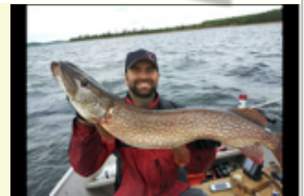
Andrew Lake Lodge & Camps Owner, Outfitter, Pilot

We look forward to seeing everyone next year for another exciting adventure.